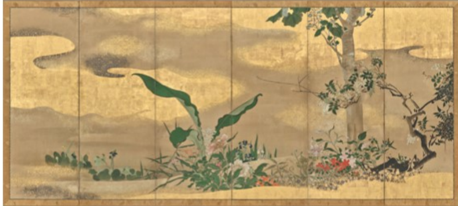
Flowers and Trees of the Four Seasons, early to mid-1700s. Watanabe Shikō (Japanese, 1683-1755). Pair of six-panel folding screens; ink, color, gold, silver, and gilding on paper; each screen: 155 x 368.5 cm. The Cleveland Museum of Art, Severance and Greta Milikin Purchase Fund, 2021.132